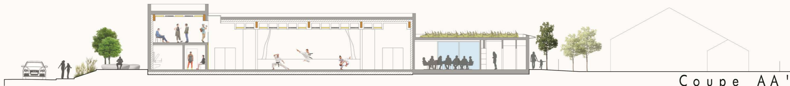
Coupe AA' Ech. 1/100